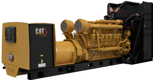
Image shown may not reflect actual configuration